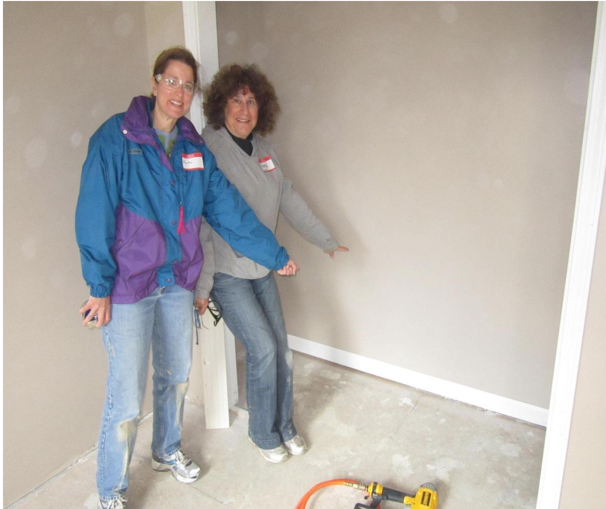
NAWN's Annual Meeting & Mixer 2011